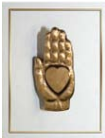
The CAP® Pin