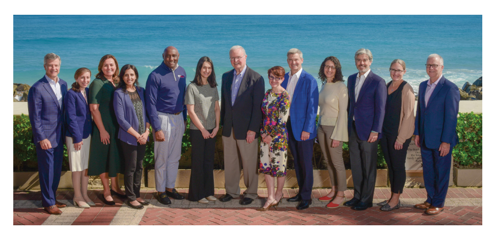
The group poses for a seaside photo.

Overall, the executives shared feedback that they valued having a community with which to discuss their dilemmas, and the academics valued having scenarios and cases to inform their teaching and research.